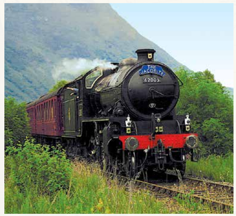
The Jacobite steam train, renowned as the Hogwarts Express in the Harry Potter film series, recreates the glorious era of rail travel amid the rugged beauty of Scotland's western Highlands.