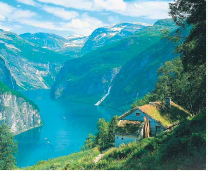
The natural wonders of Norway's waterways share the landscape with charming farms and fishing villages.

oin us for a unique, comprehensive, nine-day Scotland's rarely journey to visited Inner Hebridean, Orkney and Shetland Islands and Norway's majestic fjords, remote destinations forever linked by their Viking heritage. Cruise from Glasgow, Scotland, to Copenhagen, Denmark, aboard the exclusively chartered Five-Star small ship M.S. L'AUSTRAL with spacious, 100% ocean-view Stateroom and Suite accommodations. Travel in the wake of early Viking explorers, cruising into ports accessible only to small ships amid spectacular landscapes. Specially arranged excursions include a journey on The Jacobite steam train through the Scottish Highlands; Kirkwall in the Orkney Islands; prehistoric Jarlshof in the Shetland Islands; and the UNESCO World Heritage sites of Orkney's Neolithic Ring of Brodgar and Skara Brae, including a special presentation by local archaeologist and site director Nick Card, and Bergen's picturesque Bryggen. Enjoy exploring Norway's beautiful Hardangerfjord. A Glasgow + Edinburgh Pre-Cruise Option and Copenhagen Post-Cruise Option are offered.