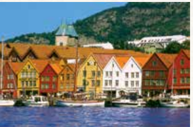
Bergen's Bryggen (the old wharf), a UNESCO World Heritage site.